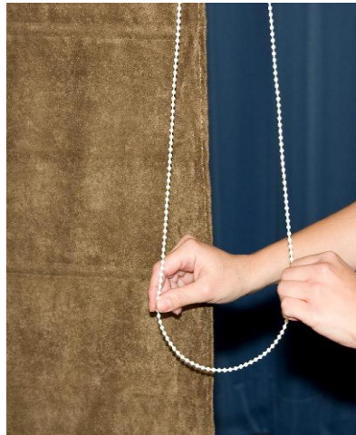
Example of Roman Shade