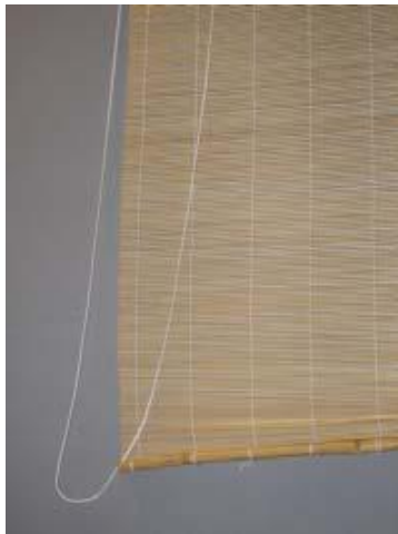
Example of Roll-Up Blind

Strangulation Death of a Child Prompts Recall of Roman Blinds; Sold Exclusively at IKEA http://www.cpsc.gov/cpsc/pub/prerel/prhtml09/09050.html